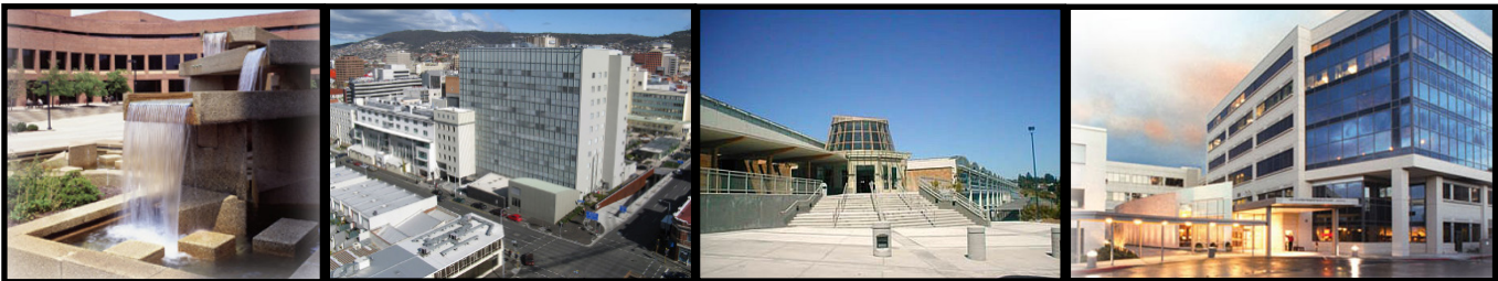
Colleges Hospitals Gymnasiums Prisons Schools Military Casinos